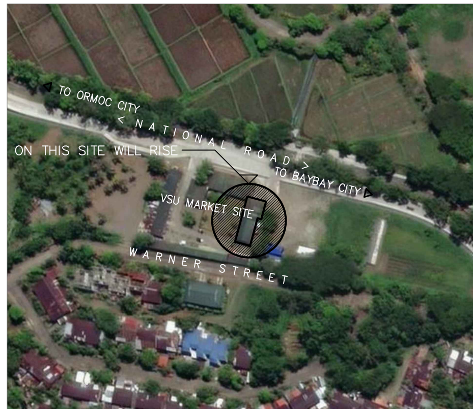
LOCATION MAP SCALE 1: 125M