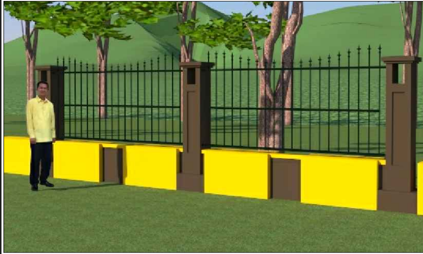
PERSPECTIVE OF TYPE-A FENCE