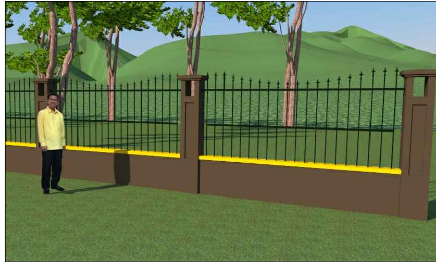
PERSPECTIVE OF TYPE-B FENCE