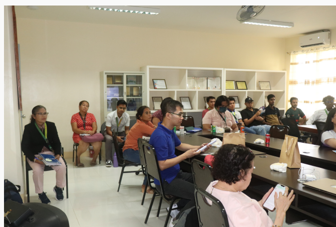
Fulbright personnel during their visit in VSU Graduate School