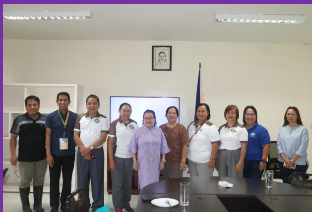
Faculty of ESSU together with GS Staff & Faculty

the use of innovation and Green Technology for sustainable practices and demonstrate