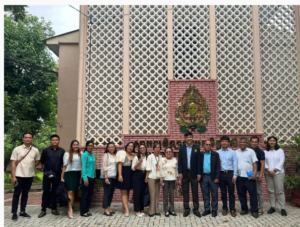
VSU Faculty and Staff during their visit to universities in Vietnam, Laos and Cambodia