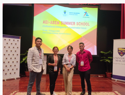
VSU Graduate Students during AEI-ASEM