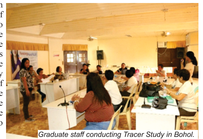
Graduate staff conducting Tracer Study in Bohol.

According to the study, of the 73 respondents who returned their questionnaires, 72 reported to be gainfully employed. A very high percentage (85%) have regular or permanent items, nearly a third (30%) are holding supervisory